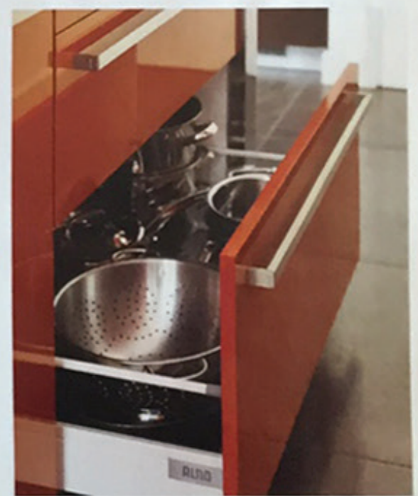
RIGHT Deep island drawers are mounted on soft-close runners and provide an efficient storage space for Viki to keep her pots and pans. The long bar handles from Alno are finished in stainless steel and match the room's other metallic elements, such as the smart worksurfaces.