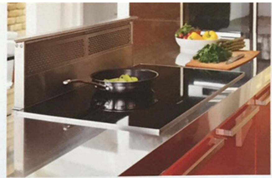
LEFT Viki chose to pair her induction hob with a retractable downdraft extractor from Wolf. 'Fitting a large ceiling-mounted hood over the island would have compromised the design of the room,' she explains.